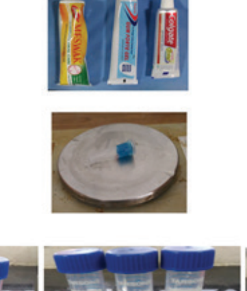
Figure 1. Preparation of dentifrice formulation

Zone of inhibition against S. Mutans was found to be higher in homeopathic dentifrice followed by herbal dentifrice, and the least by conventional dentifrice, and no inhibition at 1:5, 1:10 and 1:15 dilutions, respectively (Table 1). Zone of inhibition against C. Albicans was found to be higher in herbal dentifrice followed by conventional dentifrice, and no inhibition, and the least by homeopathic dentifrice at 1:5, 1:10 and 1:15 dilutions, respectively. Zone of inhibition against E. Coli was found to be higher in herbal dentifrice followed by conventional dentifrice at 1:5, 1:10 and 1:15 dilutions, respectively. Zone of inhibition against E. Coli was found to be higher in herbal dentifrice followed by conventional dentifrice, and no inhibition by homeopathic dentifrice at 1:5, 1:10 and 1:15 dilutions, respectively.